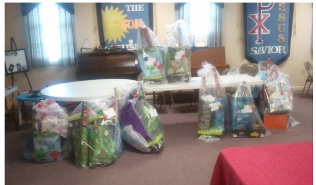
Deacons gift bags